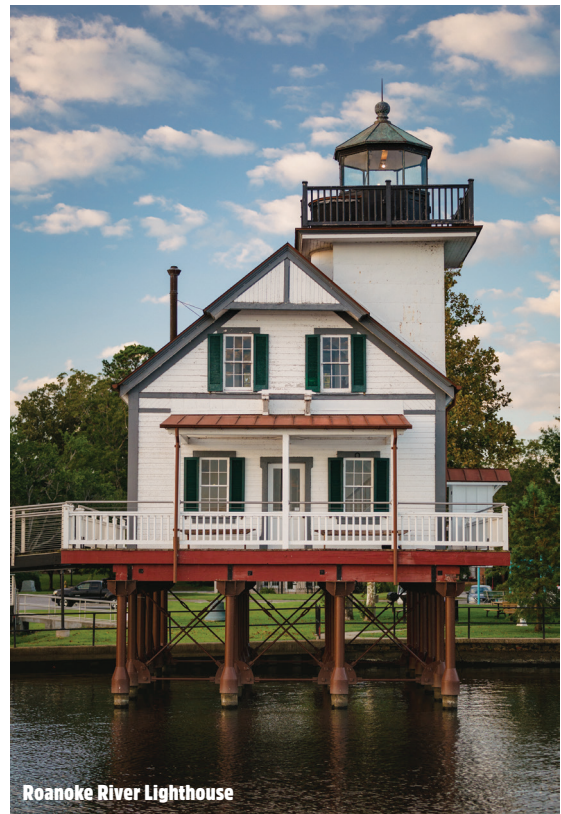
Roanoke River Lighthouse