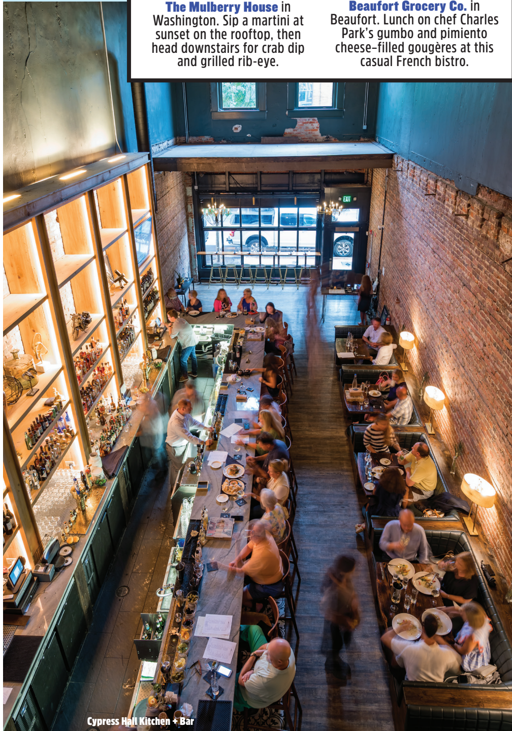
Cypress Hall Kitchen + Bar

Starting June 3, American Airlines will offer direct flights from Reagan National Airport to New Bern's Coastal Carolina Regional Airport. The newest way to breathe in the Inner Banks' salty air and take in the maritime charm is through Harbor Towns Cruises , a ferry loop that starts in Edenton and connects five counties in the Inner Banks. Guests can dine aboard an 85-foot excursion boat while traveling across the Albemarle Sound, and additional boats are planned to act as "fast ferries" to more easily shuttle around day-trippers.