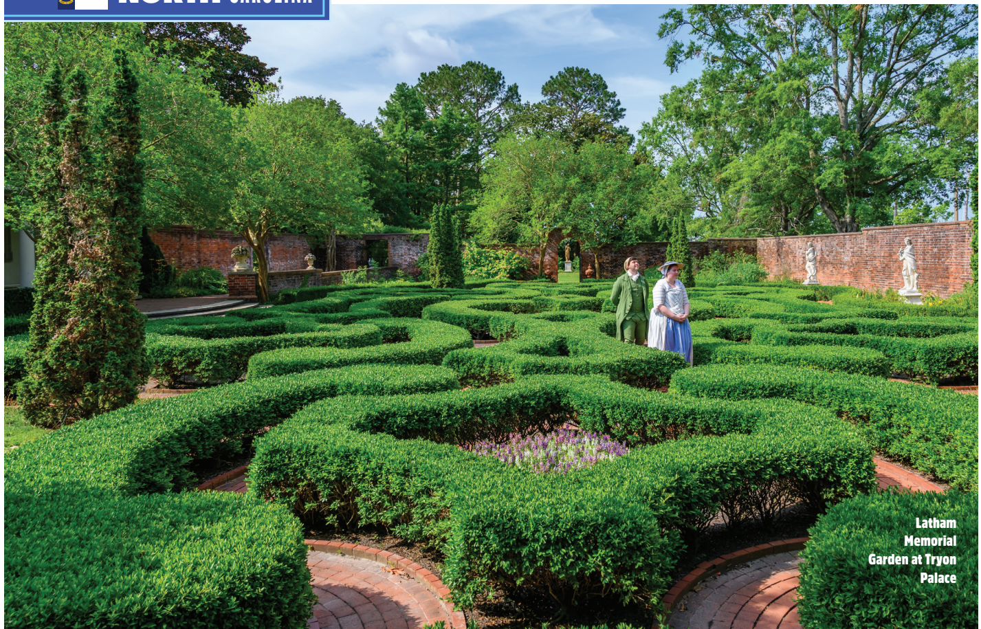
Latham Memorial Garden at Tryon Palace