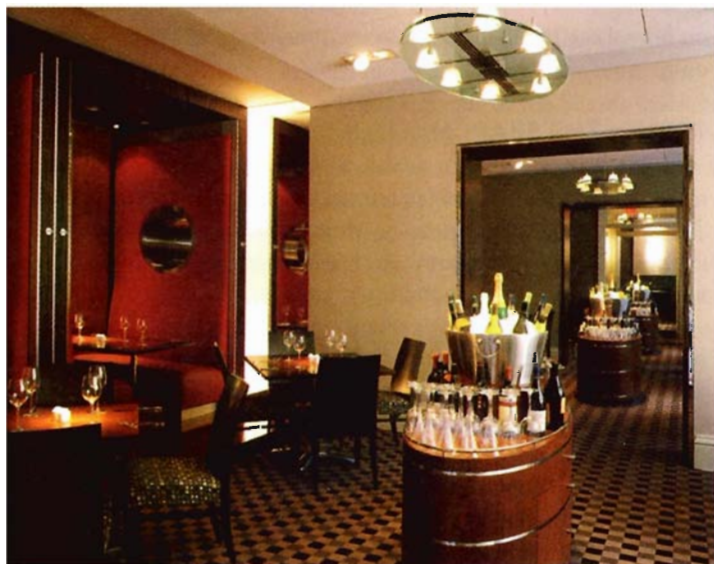
● Sleek Zola serves streamlined but inventive cocktails.