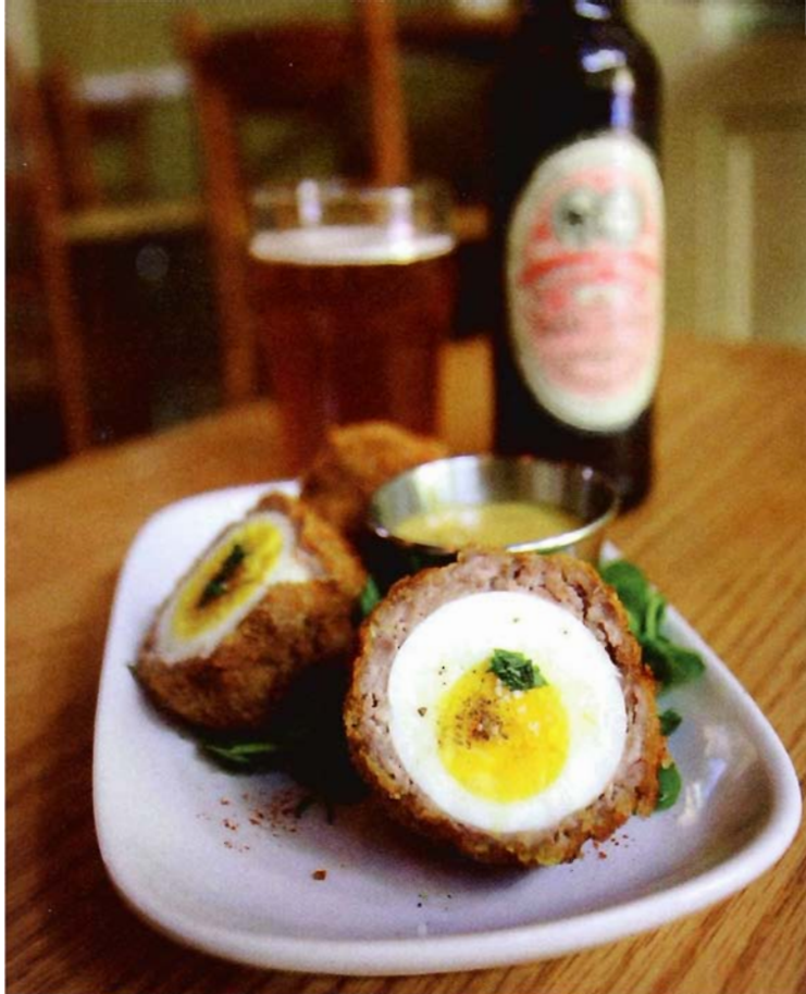
At Commonwealth, food items are designed to pair well with beers brewed in Virginia, Pennsylvania, Massachusetts and Kentucky.